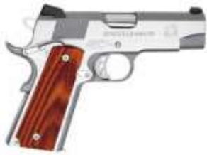
Springfield Loaded Champion .45 ACP

With the (very) successful conclusion of our annual PPC Match and Sweepstakes, it's once again time to begin our monthly-ish FLSC Firearm Sweepstakes drawings. So far, the club has awarded: