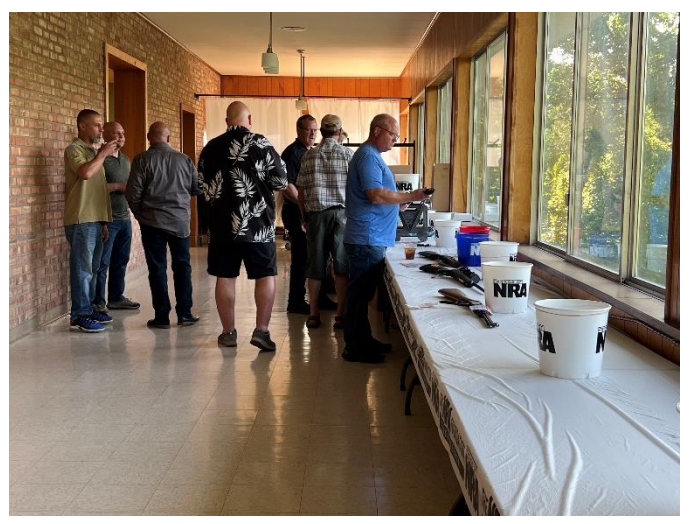
We look forward to seeing everyone next year and make sure to bring a friend!

It was a great night of camaraderie and fundraising for an organization that supports kids and women's shooting programs throughout the state and the country. We will hopefully have more details on what was raised and programs that benefited in next month's newsletter.